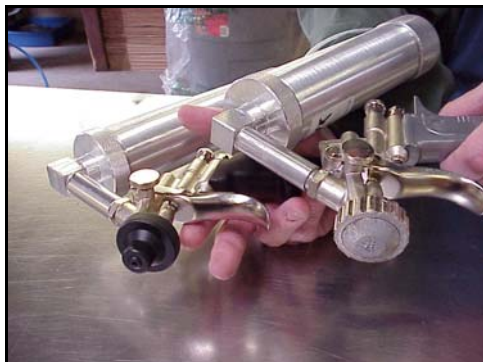
NEW STYLE GUN ON LEFT, OLD STYLE GUN ON THE RIGHT