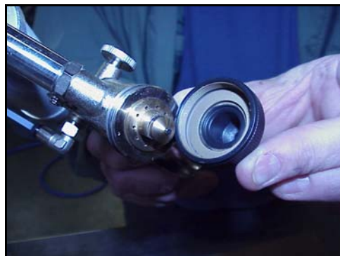
INTERIOR OF AIR CAP