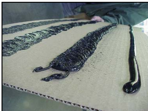
WET LOOK CAN BE ACHIEVED WITH EITHER GUN AND EITHER COLOR SEALER