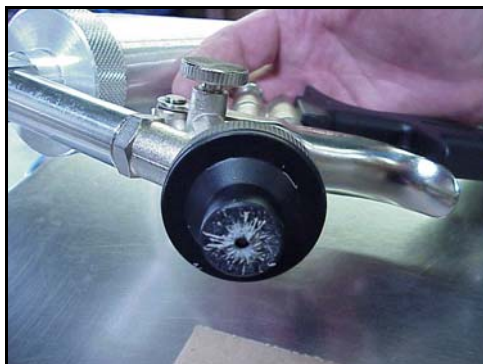
NEW GUN VERY LITTLE OVERSPRAY ON AIR CAP