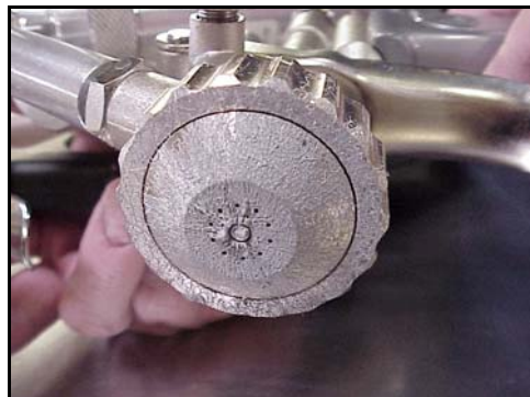
OLD STYLE GUN CONSIDERABLE OVERSPRAY ON AIR CAP