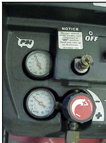
TESTING 75 P.S.I. AT THE HOSE

NOTICE The report indicates critical failures from overpressure for "OFF" position. Reset may take up to 30 minutes. or longer.