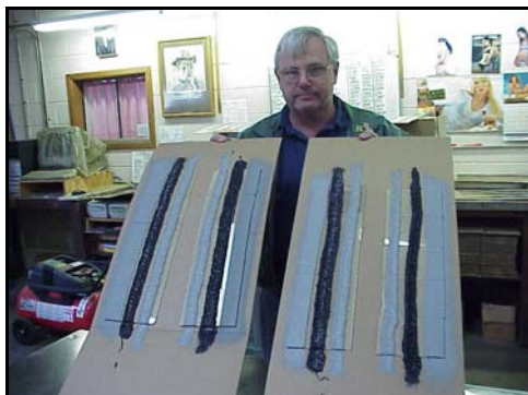
MAKING GRAY & BLACK TEST PANELS