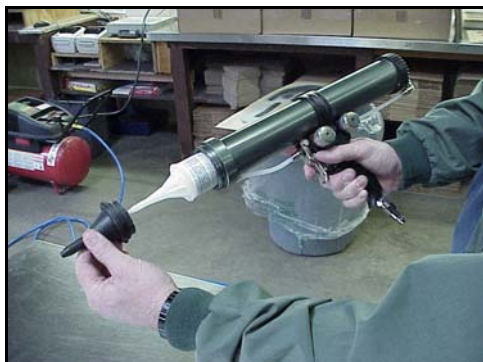
LOADING THE UNIVERSAL "BAZOOKA" GUN