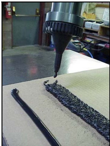
DETAIL CLOSEUP OF "BAZOOKA" GUN DUPLICATING MULTIPLE PATTERNS